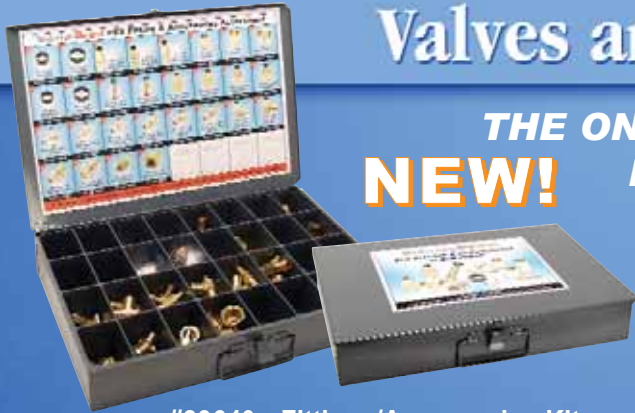
#83640 - Fittings/Accessories Kit

THE ONLY WAY TO STORE AND ORGANIZE NEW! PEX FITTINGS ON THE JOB!